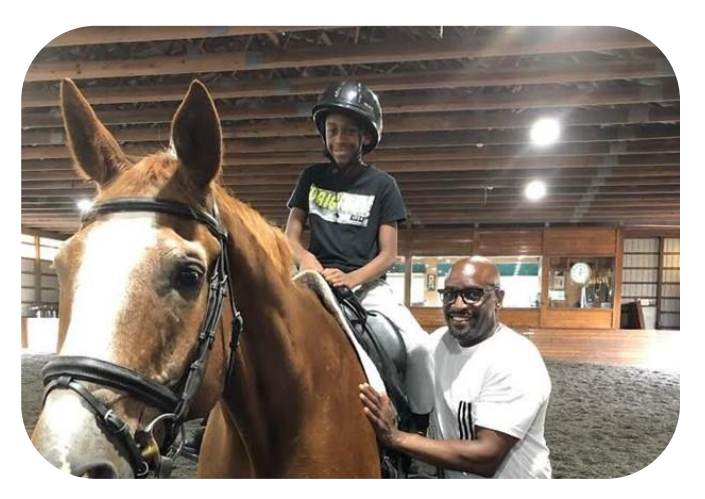
An annual pledge of $520.00 ($10 per week) -- will fund group activities for matches, such as visits to museums, sporting events, arts and crafts workshops, and community events.