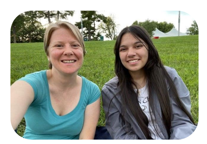
An annual pledge of $52.00 ($1 per week) -- will ensure the safety of children and youth in our program, by covering FBI and state background checks.