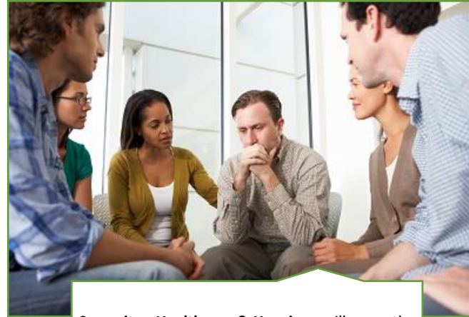
Samaritan Healthcare & Hospice - will cover the expenses associated with conducting a monthly group grief support meeting.