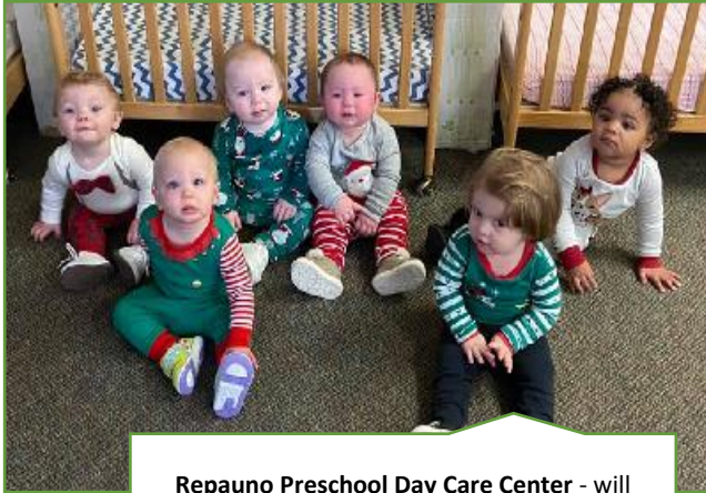
Repauno Preschool Day Care Center - will supply five (5) sleep sacks, giving safety and warmth to babies under one (1) year of age who should not use blankets.