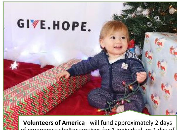
Volunteers of America - will fund approximately 2 days of emergency shelter services for 1 individual, or 1 day of emergency shelter services for 2 individual family members, including case management, 24/7 on-site supervision & support, transportation, meal service, and workshop programming.