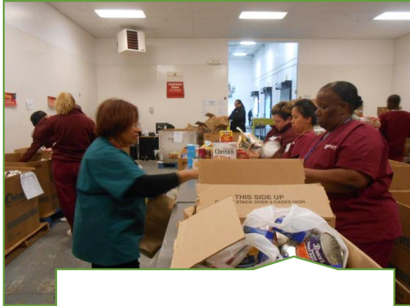
Food Bank of South Jersey - provides for 3,133 pounds of food (the equivalent of 2,610 meals).