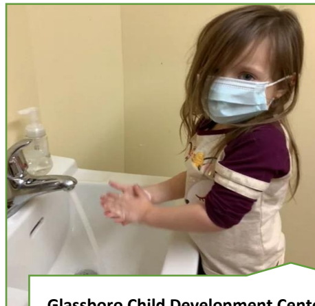
Glassboro Child Development Centers - pays for our program space to be professionally cleaned with an electrostatic sprayer to keep the area free of Covid-19.