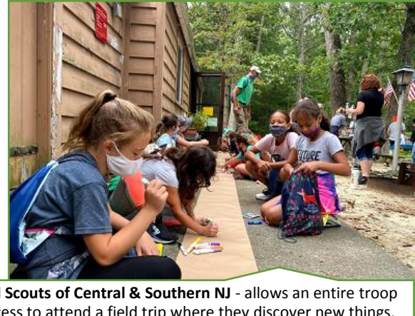
Girl Scouts of Central & Southern NJ - allows an entire troop access to attend a field trip where they discover new things, connect with other people, and explore the world around them; or, for badge earning experiences for a whole group of girls, as they learn new things, find their voice, and make lifelong memories.