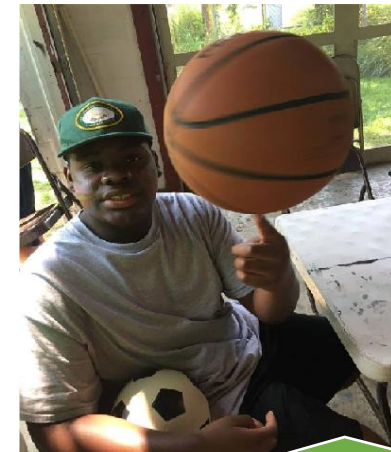
Arc Gloucester - Camp Sun 'N Fun: will pay for purchase of sports balls which wear out within the year and need to be replaced annually.