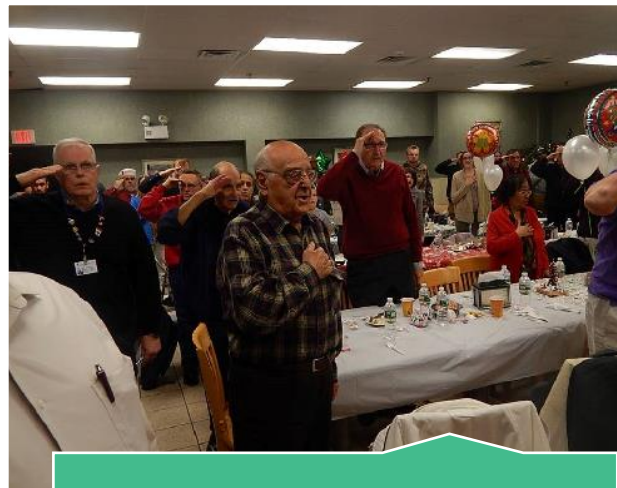
Abilities Solutions - VetAbility: vehicle repairs to restore transportation to get to a job.